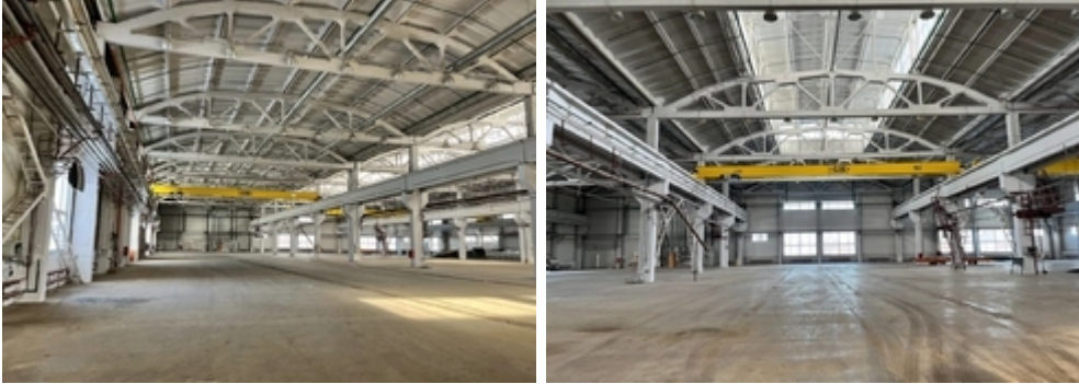
Industrial and warehouse facility in Volhov • RENT